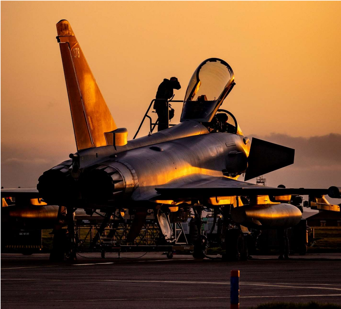
"Last Checks" The Evening Hymn. Second Place in RAF Photo Competition: Cpl Sian of RAF Lossiemouth.