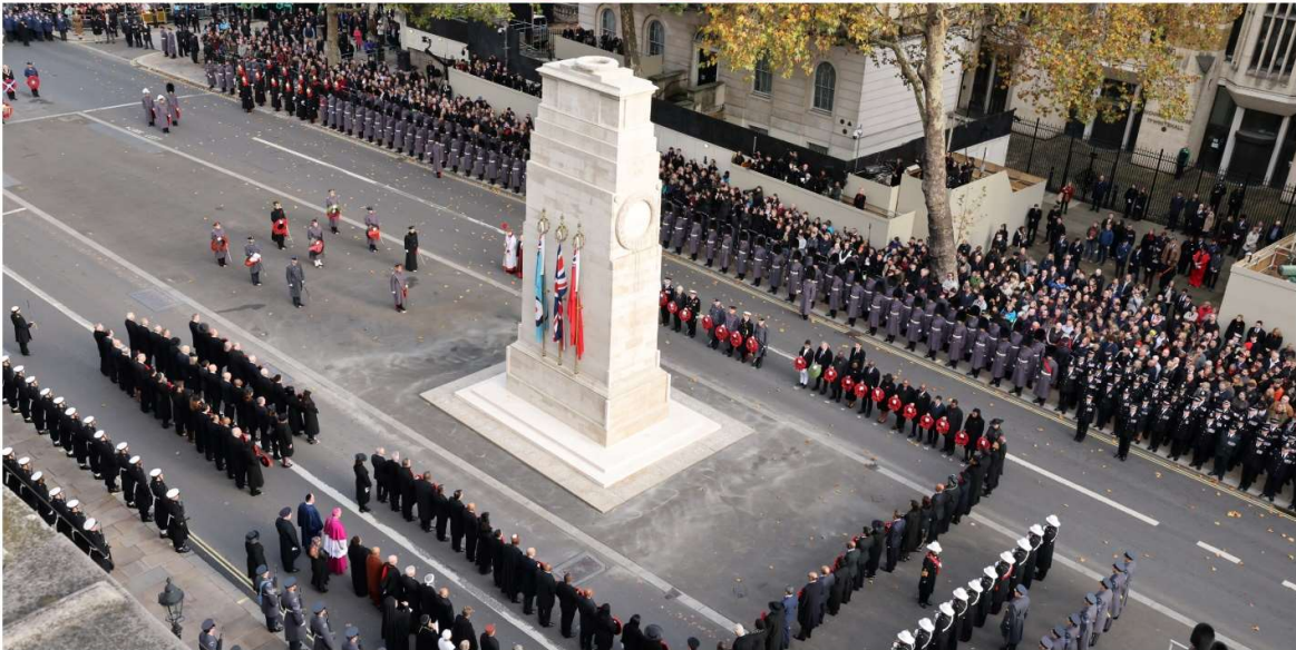
The Defence Service Chiefs lay their wreaths: Chief of the Defence Staff, Air Chief Marshal Sir Richard Knighton, Chief of the Naval Staff, General Sir Gwyn Jenkins, Chief of the General Staff, General Sir Roly Walker, Chief of the Air Staff, Air Chief Marshal Harv Smyth