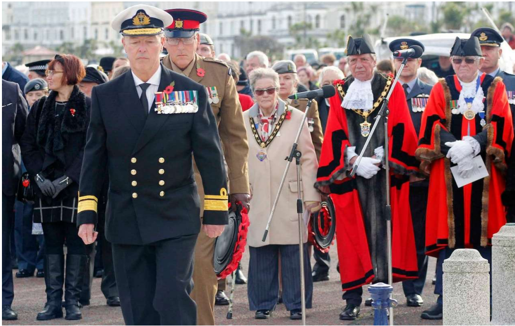
Fake admiral' takes centre stage at Remembrance event in Welsh town. The 'Insulting' suspected impostor arrived unannounced, took part in Parade

Military veterans were left fuming when a suspected imposter dressed as a Rear Admiral turned up at this year's Remembrance Sunday ceremony in Llandudno, Conwy. Wearing a Royal Navy uniform adorned with medals, he inveigled his way into the solemn event by claiming to represent the Lord Lieutenant's Office. The man, dubbed a supreme "Walter Mitty figure", even saluted at the war memorial during the wreath-laying event. Subsequent investigations by North Wales Live have revealed the man previously appeared in a Rear Admiral's uniform at Remembrance Sunday ceremonies in Caernarfon, Gwynedd.