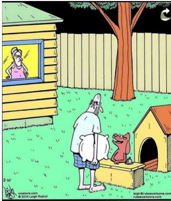
"Welcome back, sir. Are you planning on being our guest for one night only, or will this be your usual extended stay?"

Did you know? 🤔 If you lose a sock in the laundry - it comes back as a Tupperware lid that doesn't fit any of your containers. 😂 🧦 🤪