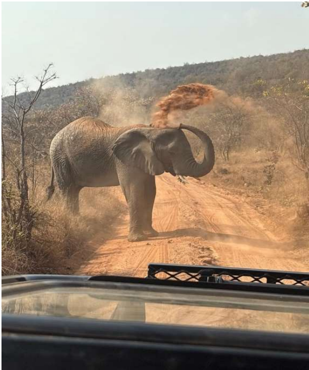
Beautiful day for a dust bath Simone Sim

#RugbyChampionship #Springboks #AllBlacks #FafDeKlerk #RassieErasmus #BongiMbonambi #NZLvRSA #EdenPark #SouthAfricanRugby #RugbyUnion