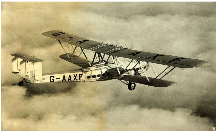
Imperial Airways' Handley Page HP.42, G-AAXF, Helena, in flight.